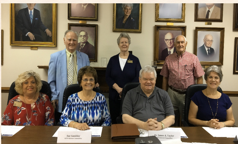
LRTA Bylaws Committee

These recommendations will go before the Executive Board at the state Fall Meeting in Bossier City. After the Executive Board reviews the recommendations, the proposed Bylaws changes will be posted on the LRTA website. Members will have a chance to review the recommendations and ask questions or address concerns. These recommendations will also be included in the Winter Newsletter. Members will vote on these changes in January 2019.