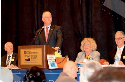
Governor John Bel Edwards