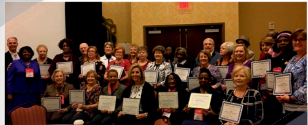
2018 Unit Challenge Winners