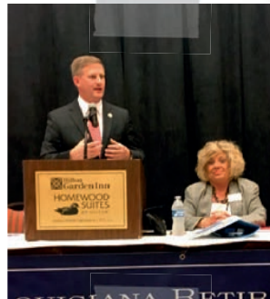
Senator Barrow Peacock