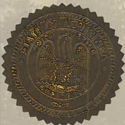
John Bel Edwards Governor

IN WITNESS WHEREOF, I have hereunto set my hand officially and caused to be affixed the Great Seal of the State of Louisiana, at the Capitol, in the City of Baton Rouge, on this 17th day of March A. D., 2022.