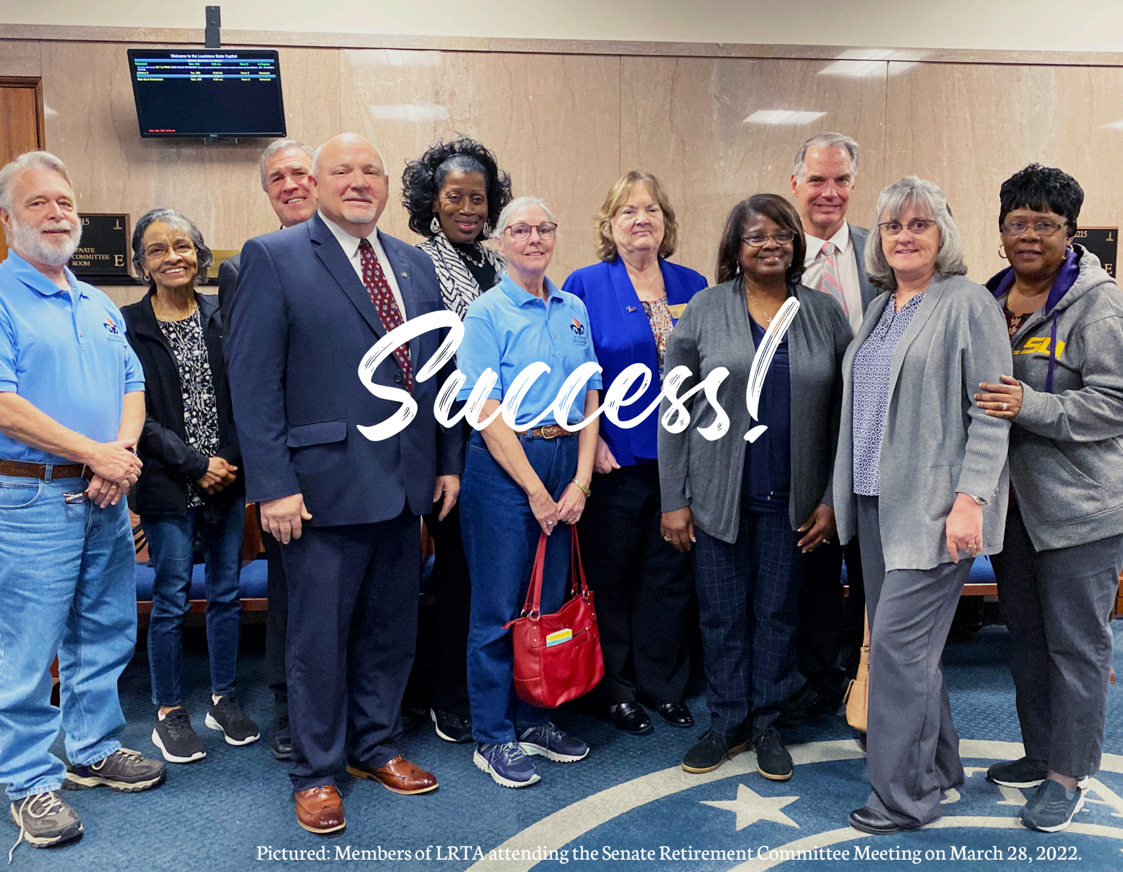
Pictured: Members of LRTA attending the Senate Retirement Committee Meeting on March 28, 2022.