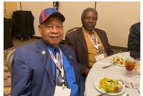
Pictured: LRTA members enjoying the pre-convention banquet.