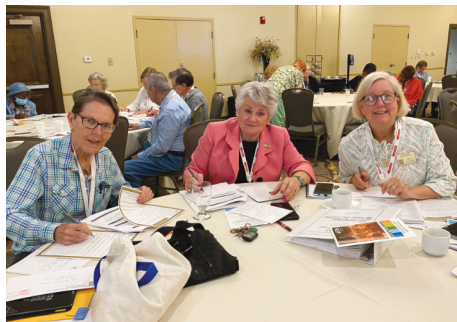
Pictured: LRTA members and officers writing their “Golden Letters.”