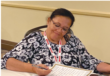
Pictured: LRTA member participating in letter writing campaign.