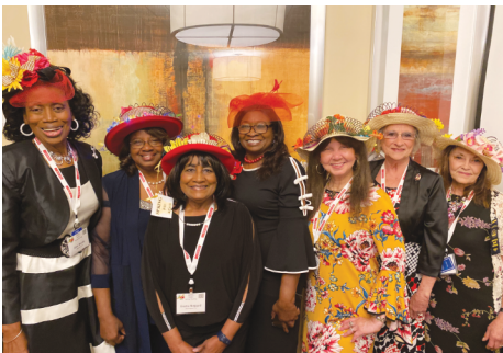
Pictured: The LRTA “Hat Ladies” posing at the pre-convention banquet.

Thank you to everyone who attended the meeting this year. We enjoyed meeting with new and returning members, and we hope you enjoyed the meeting!