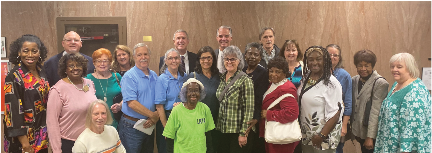
Pictured: Members of LRTA attending the Senate Retirement Committee Meeting on April 10, 2023

PROVIDED BELOW is a list of bills that were pre-filed and/or introduced for consideration by the Legislature during the 2023 Legislative Session that potentially impacted you as a retired educator and/or your retirement system. The descriptions of the bills have been taken from the legislative text and digests.