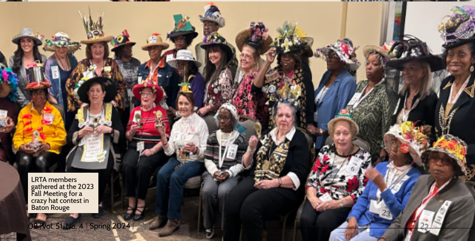
LRTA members gathered at the 2023 Fall Meeting for a crazy hat contest in Baton Rouge