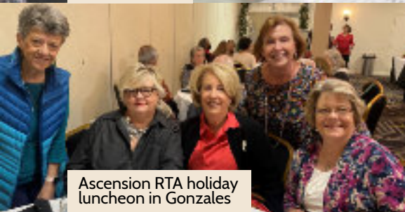
Ascension RTA holiday luncheon in Gonzales