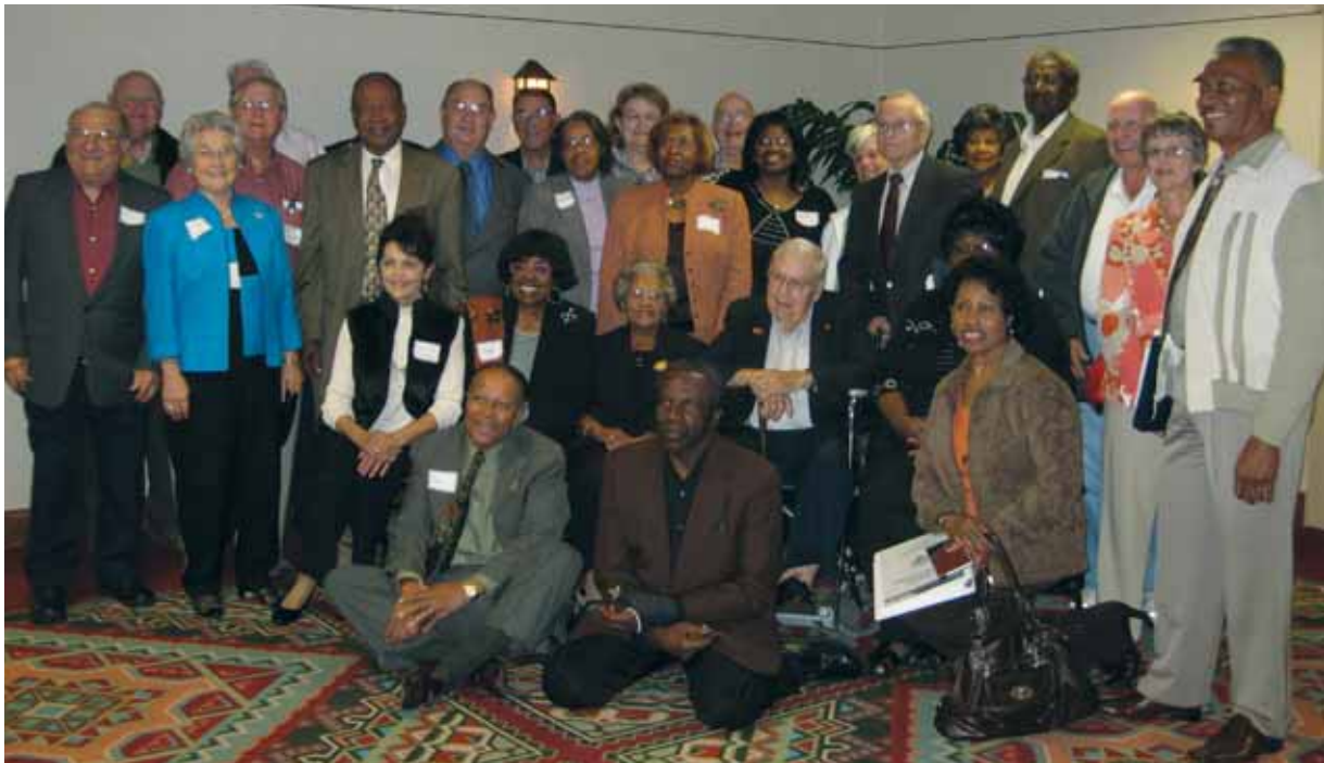
LRTA conducted a Leadership Training Workshop in Baton Rouge on November 13. The workshop program and resources were designed to assist current and future leaders of the Association. The workshop replaced the Drive-In Workshops conducted by LRTA in the past, and will become an annual event. Every LRTA District was represented at the training session, and those who attended are pictured here. We had a very lively, dedicated and productive group.